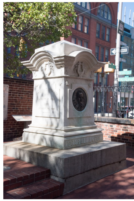
UMB IS LOCATED IN THE HISTORIC CITY OF BALTIMORE, WHERE FAMED POET EDGAR ALLAN POE IS BURIED ON THE GROUNDS OF WESTMINSTER HALL.