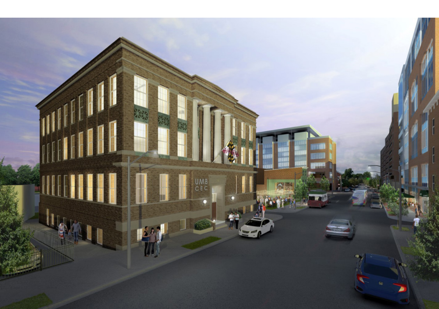
RENDERING OF THE CEC AT 16 S. POPPLETON ST.