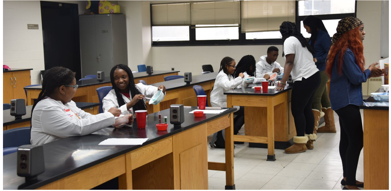
CURE SCHOLARS INTERACT WITH ASCEND SCHOLARS AT THEIR LAB AT MORGAN STATE UNIVERSITY.

The School of Pharmacy also began an infectious diseases workshop for all scholars. They also learned about sexuality and health education during their Saturday component.