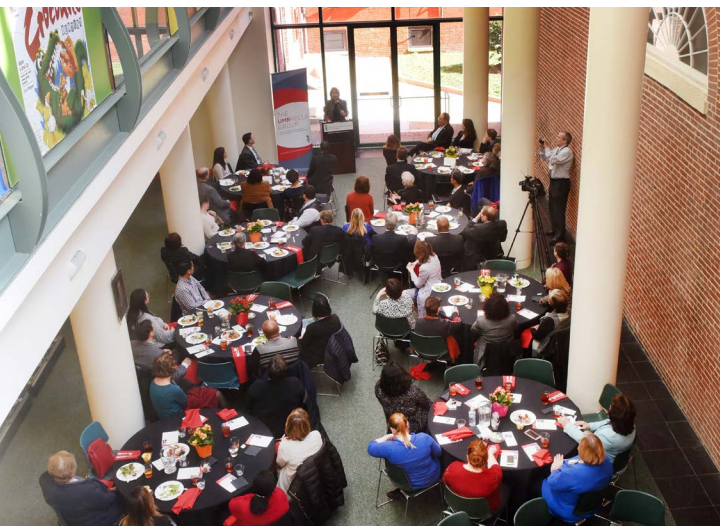
OVER 100 CAME TO THE DR. SAMUEL D. HARRIS NATIONAL MUSEUM OF DENTISTRY TO HEAR WHAT THE SAFE CENTER IS DOING TO HELP SURVIVORS.

The number of human trafficking victims in the U.S. is hard to quantify because it is a crime hidden from view, Esserman said. The International Labor Organization estimates 25 million people are trapped in human trafficking. The 2016 Global Slavery Index reports human trafficking occurs in more than 165 countries.