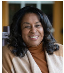
Cindy Pumphrey School of Nursing