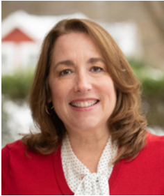
Irene Amoros School of Medicine