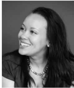
Lori Harris School of Nursing