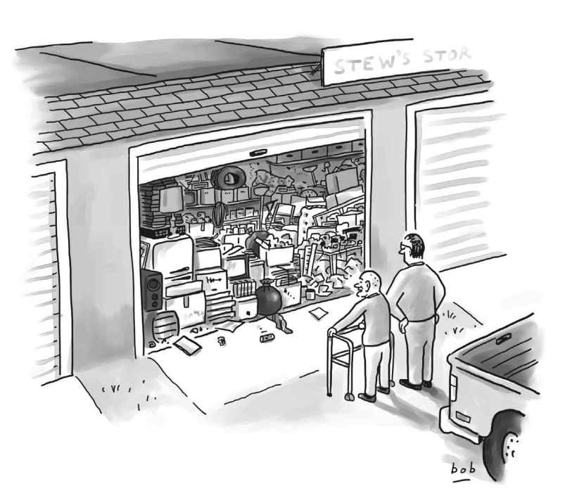
"One day Son all this will be yours."

Your generosity will ensure that the University of Maryland, Baltimore will continue to provide exceptional service to our students for generations to come.