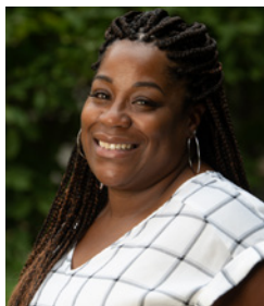
Rose Delaney School of Nursing