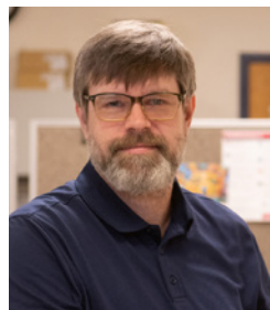
Philip Johnson School of Pharmacy