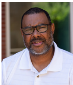
Patrick Williams Health Sciences and Human Services Library