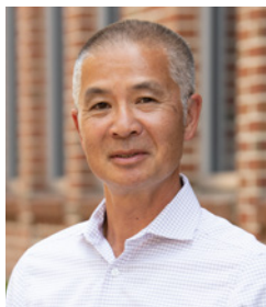
Chris Raab Center for Information Technology Services