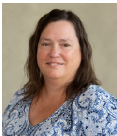
Michelle Besser School of Pharmacy