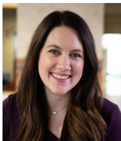
Laura Hager School of Nursing