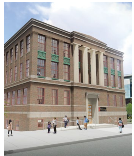
16 S. Poppleton Street

public schools, rigorous curricula are being implemented, student achievement is climbing, and investors are transforming the school and school culture. Our School of Social Work is embedded at James McHenry as the community school partner, convening agencies and nonprofits to provide students and families a network of wraparound services.