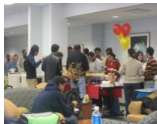
WorldFest 2007

The ISO is a USGA-sponsored student organization aimed at promoting the interests of international students at UMB and stimulating cross-cultural exchange within the UMB community. Membership is open to all current students of UMB. The ISO welcomes everyone to attend its many events such as World Fest and International Dessert Festival throughout the year. Subgroups of the ISO include Chinese Student and Scholars Association (CSSA) and Indian Association (IA). More information regarding World Fest and the ISO can be found at www.umaryland.edu/iso .