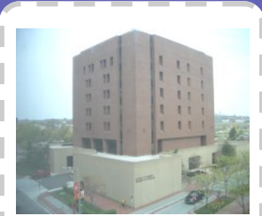
Pharmacy Hall

Email Address for Committee Members: House Appropriations Committee http://www.msa.md.gov/msa/mdmanual/06hse/html/com/01app.html Senate Budget & Taxation Committee http://www.msa.md.gov/msa/mdmanual/05sen/html/com/01bud.html