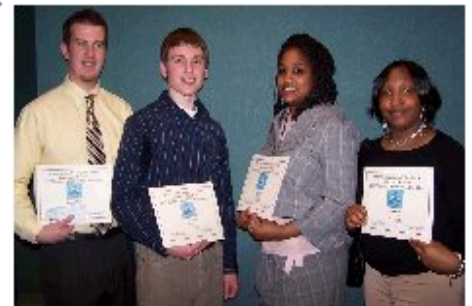
2007 ASCLS Case Study Competition

The future lab scientists and biotechnologists of DMRT will be distributing informational flyers in the Sandtown/Winchester area through Enterprise Partners as part of the Community Service Day event held by the School of Medicine.