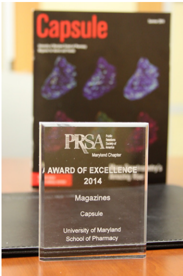
CAPSULE MAGAZINE AND THE PRSA AWARD.

The Office of Communications and Marketing received a Best in Maryland Award of Excellence from the Public Relations Society of America's Maryland chapter for the magazine Capsule .