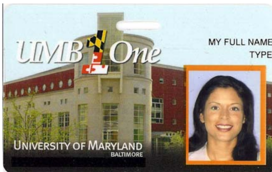
UMB1 One Card Barcode

UMB faculty, students, staff and affiliates have been assigned an UMB1 One Card barcode. The 14-digit barcode is listed on the back of the UMB1 One Card.