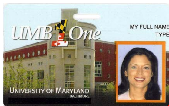
UMB1 One Card Barcode